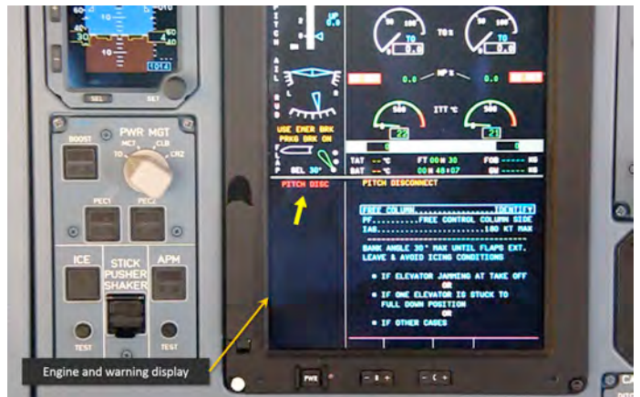
Arrows lead to cockpit ‘Pitch Disconnect’ warning

The forces applied on one side of the pitch control system are transmitted to the opposite side as a torque or twisting force through the pitch uncoupling mechanism. The pitch uncoupling mechanism activates automatically when this torque reaches a preset level, separating the left and right control systems.