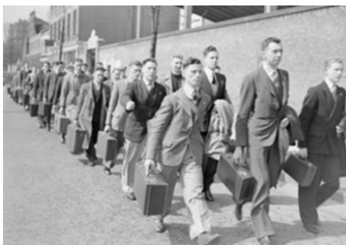
You marched...of course!

Prostitutes walking the Regents Canal towpath inviting custom from bromide saturated chaps, not 'up to it'