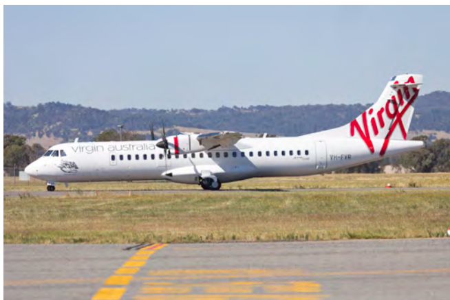
VH-FVR Virgin Australia ATR 72-600

The Australian Transportation Safety Board (ATSB) has revealed that opposite control column inputs caused a “pitch disconnect” on a Virgin Australia ATR 72-600, resulting in overstress damage to the aircraft’s horizontal stabiliser.