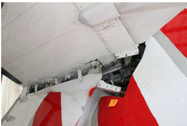
Some of the damage to the tailplane of VH-FVR

“During examination of the aircraft, the pitch uncoupling mechanism was tested in accordance with the aircraft’s maintenance instructions,” adds ATSB. “The load applied to the control column to activate the pitch uncoupling mechanism was found to be at a value marginally greater than the manufacturer’s required value. The reason for this greater value was not determined, but may be related to the damage sustained during the pitch disconnect event.”