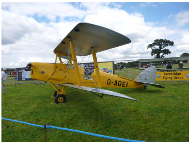
G-AOEI DH 82A Tiger Moth

Celebrating the 85th Anniversary of the Tiger Moth at Shuttleworth, Old Warden Aerodrome. Come along and enjoy the sight of a gorgeous gathering of Moths.