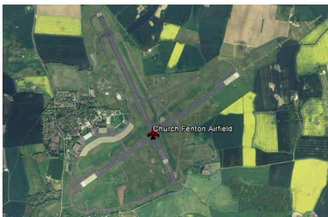
'Leeds East Airport' aka 'RAF Church Fenton'