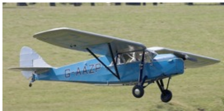
de Havilland Puss Moth airborne

It really was a wonderful time and before we left we made a contribution to their Charity collection.