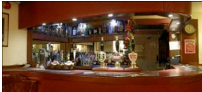
The well stocked bar

It was particularly good to see Jack Easter, just returned from a week on the south coast, looking very well and thanks to Tom Payne (as ever) for acting as chauffeur.