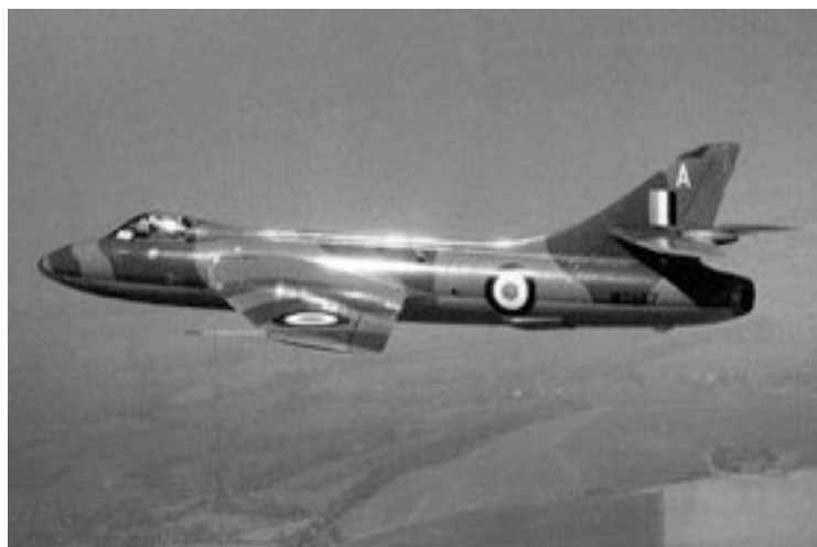
Hawker Hunter F1

Air Vice-Marshal Alan Merriman CB CBE AFC former A&AEE Commandant gave a superb presentation on 'Flight Testing' in the Royal Air Force. He commenced with the Hawker Hunter, explaining that it looked the 'perfect' aircraft, with sleek lines and an excellent set of performance figures