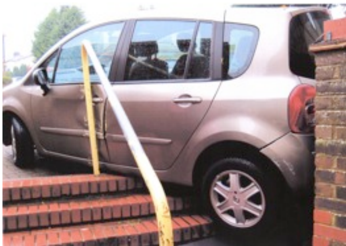
An example of Reverse Thrust

Many modern aircraft use 'Reverse Thrust' or 'Thrust Reversers' for the more backward amongst the aviation fraternity.